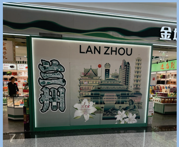
Lanzhou airport art