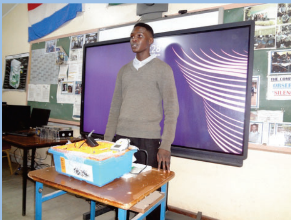
Student presenting his work