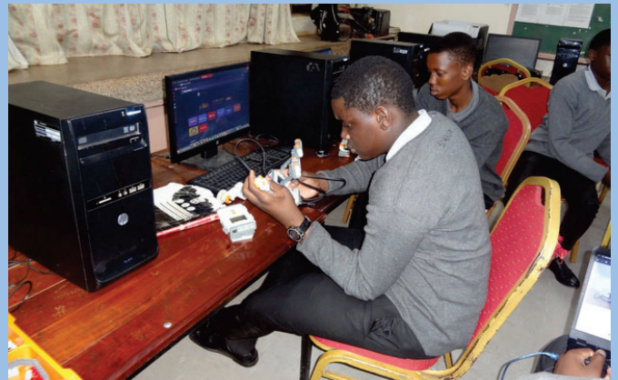
Students working together