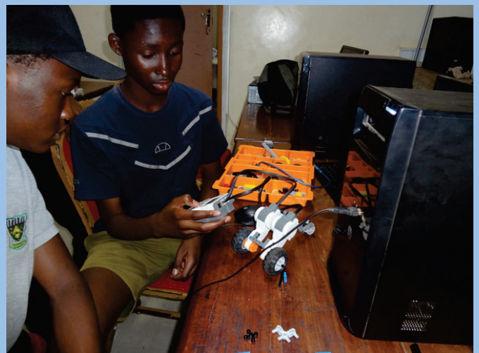
Students working together