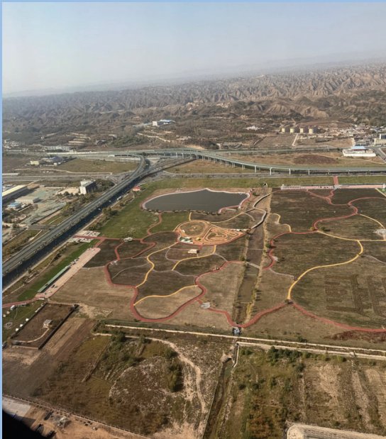
Lanzhou, China from the air

A major focus of the visit was preparation for the 30th anniversary of our sister-city relationship next year. Both sides expressed strong interest in holding commemorative events in each city and developing special programs to highlight three decades of partnership.