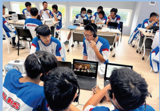
Hualien Senior High School students