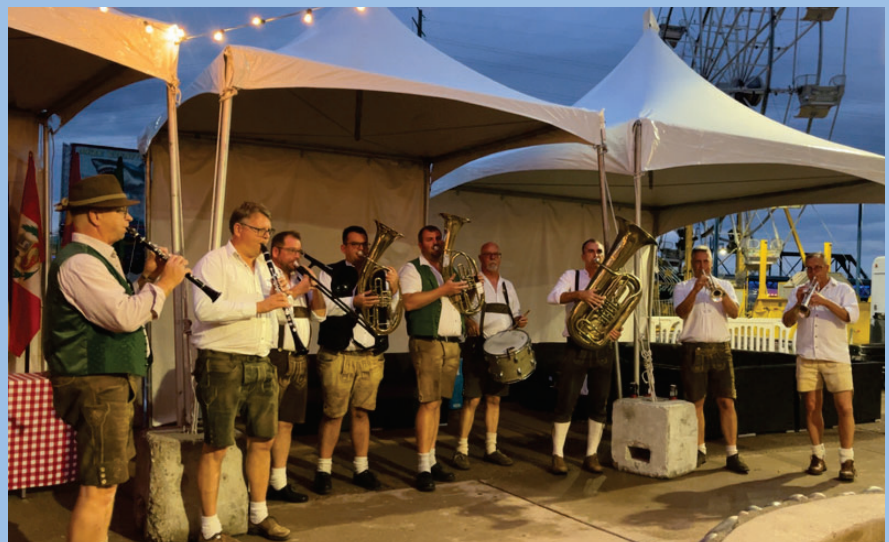
Oompah Band at Oktoberfest tour