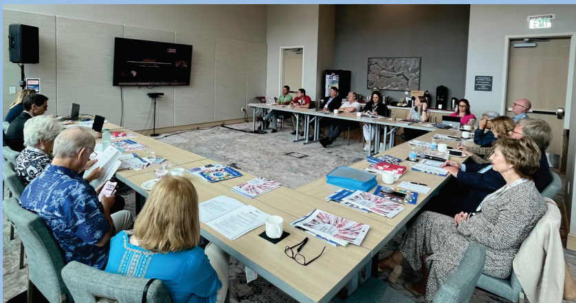
SCI Leadership Meeting