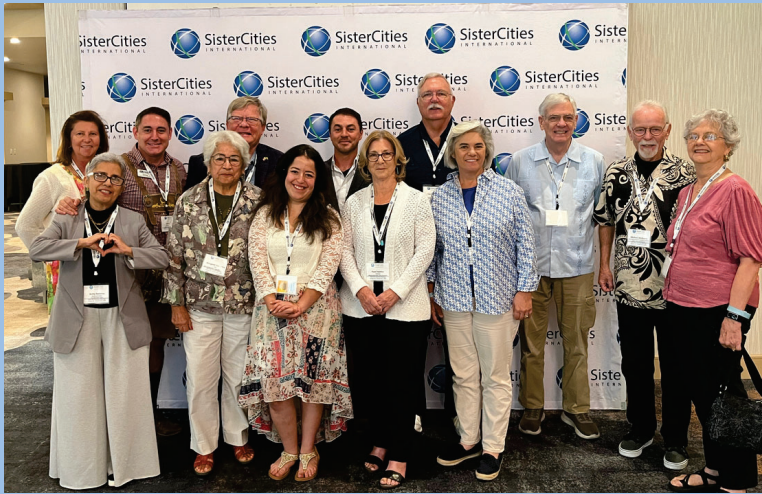
Sister Cities Chairs