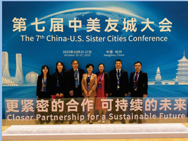
Lin Ye with Deputy Mayor Jin Fang and delegation

From October 25–27 and October 28–30, our delegation traveled to China to attend the 7th China US Sister Cities Conference and to visit our sister city. The conference gathered 180 representatives from 28 U.S. states and 36 cities and counties, along with over 200 representatives from 28 provinces in China on October 25 - 27. Participants exchanged ideas on economic development, education, culture, innovation, and people-to-people cooperation. We met with Lanzhou delegation led by the deputy mayor Jin Fang during the conference time.