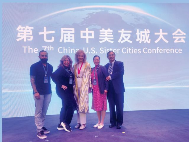
New Mexico Sister Cites Delegation