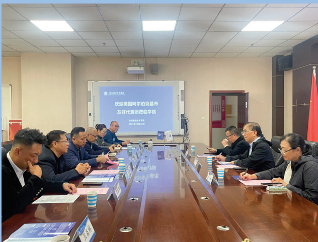
The delegation meeting with local officials and partners