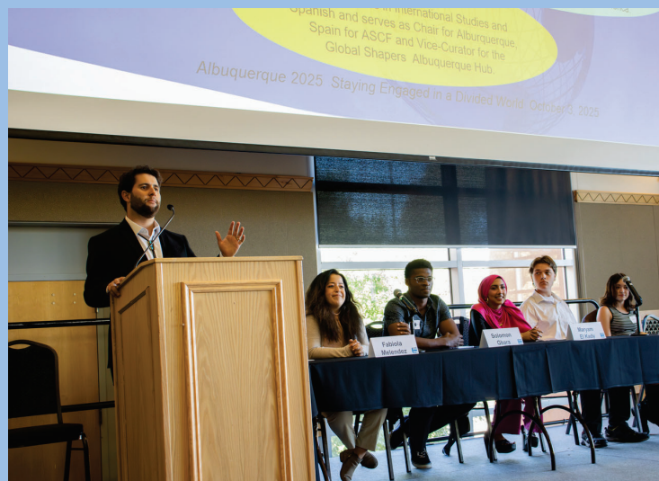
Intergenerational Approaches to Cross-Cultural Exchange