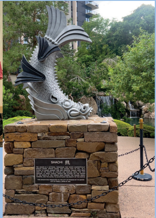
This Shachi was a presented to the City of Phoenix By its Sister City of Himeji, Japan in 1991