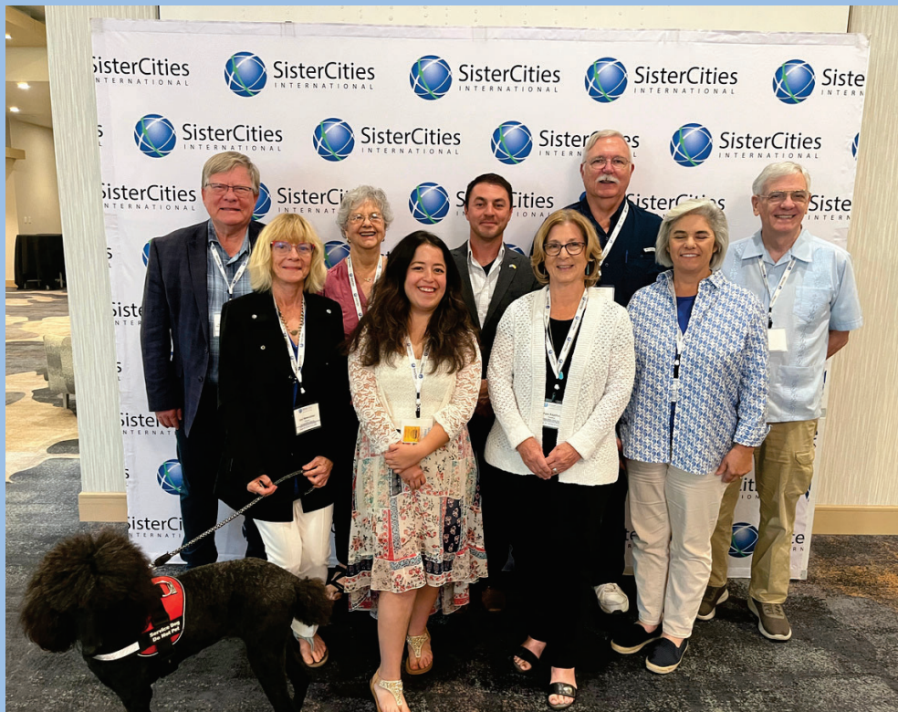
Albuquerque, Las Cruces, and Santa Fe Sister Cities reunited

The Tempe Conference was quite a memorable experience. Deepening the connection and learning from our regional cities and states was a pleasant experience. To firsthand see and learn the ways in which Tempe Sister Cities is actively engaging with its international partners to foster student exchanges and enhance engagement between Tempe. Likewise, seeing how the Arizona community bonds together to promote strengthening these relationships was well worth while. Additionally having fun and enjoying the Oktoberfest showcased firsthand how a Sister City relationship has culminated into a cherished staple of the community. The Hackett house, again was a treat to see, a home in which the Sister City relationships are showcased and used as both a learning tool and an economic opportunity to further the mission of Tempe Sister Cities. I enjoyed and learned quite a lot during the trip, and am even inspired to deepen our regional connections in the Southwest.