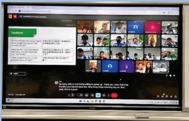
Online virtual session with all students meeting each other

The highlight of the program occurred on November 12, 2025, when students bridged a 15-hour time difference for a spirited virtual meet-up. The energy was high as students chatted in English and Chinese for an hour. This bilingual exchange was so well-received by both cohorts, leaving everyone eager for our next virtual gathering this spring!