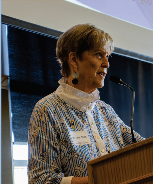
Jody Olson, Peace Corps Director, 2018 – 2021

I had the honor of participating in a panel discussion on Intergenerational Approaches to Cross-Cultural Exchange alongside students from Generation X, Generation Y, and Generation Z. This amazing panel brought together so many thoughtful and diverse perspectives, each shaped by different life experiences and generational viewpoints. The discussion highlighted how meaningful cross-cultural exchange is strengthened when multiple generations come together to learn from one another.