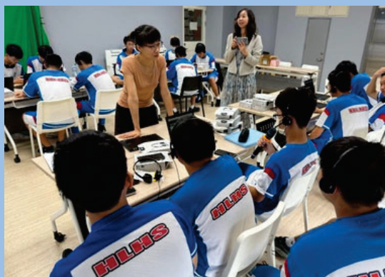
Teacher helping students