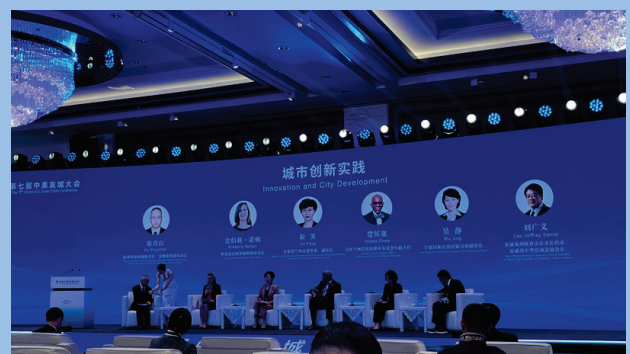
Economic Development Panel