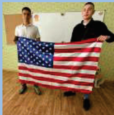
Kharkiv students holding the American flag