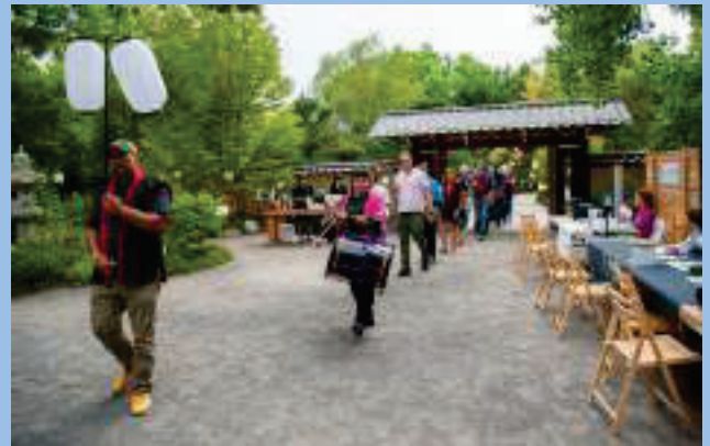
Music entertainment at the Summer Festival