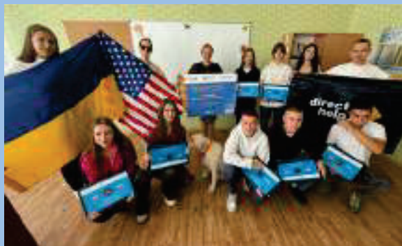
Students and teachers with the donated laptops