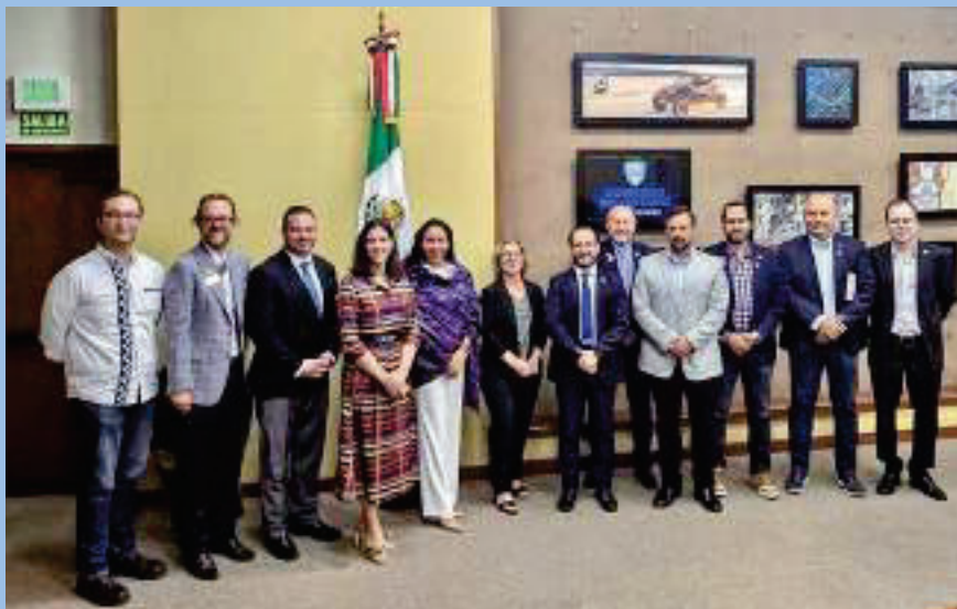
Meeting with the Albuquerque Delegation and the City of Chihuahua's Department of Economic Development