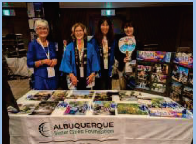
Albuquerque Delegation table at US-Japan Summit