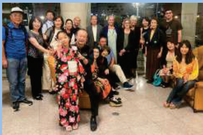
Sasebo Citizens farewell gathering with Albuquerque delegation