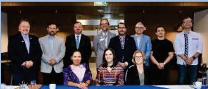
Meeting with Albuquerque Delegation and Chihuahua City Government Officials