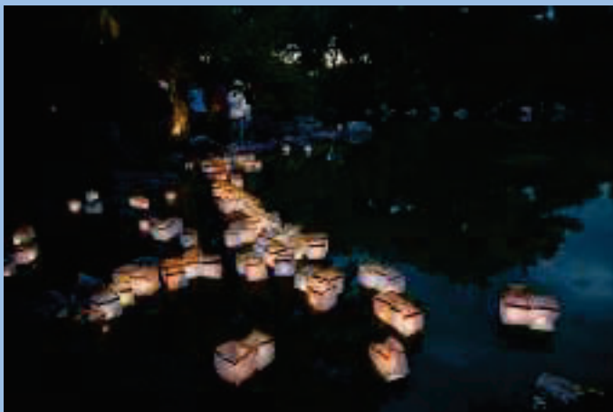
Art installation at the Summer Festival