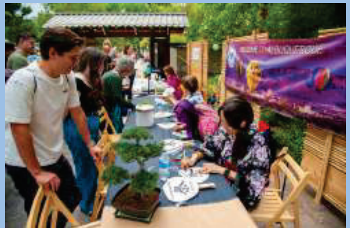
Guests creating their fans