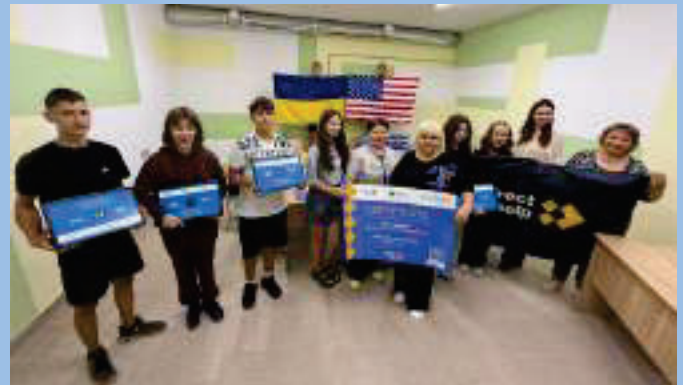
Students and teachers with the donated laptops