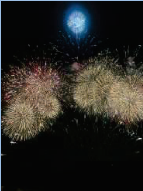
US- Japan Summit Special fireworks display