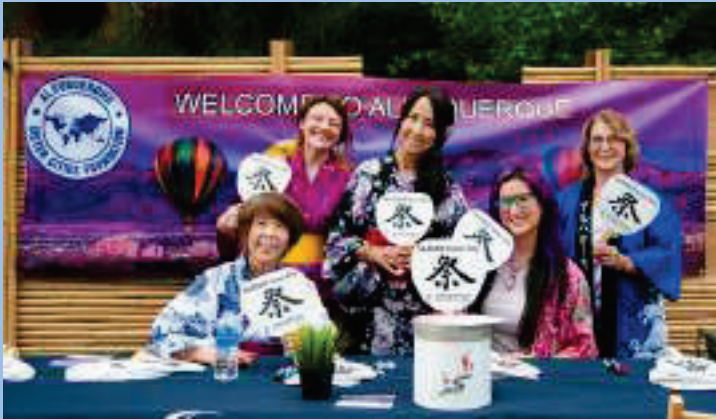
ASCF Board Members attending the Summer Festival