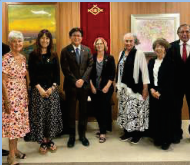
Sasebo Mayor Miyajima with Albuquerque delegation