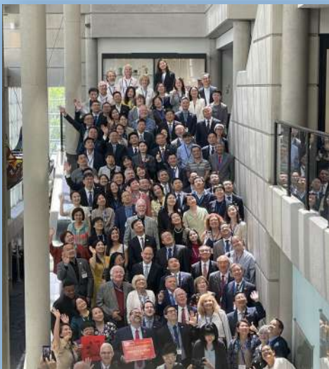
U.S./China Summit Participants