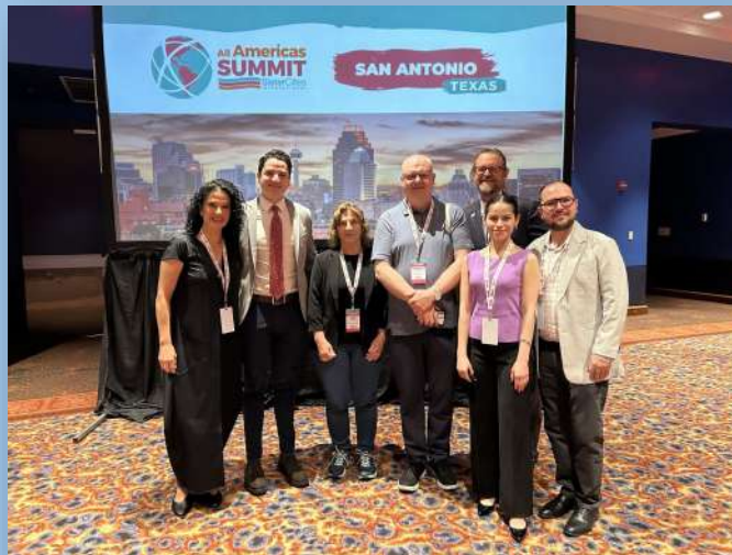
Guadalajara and Albuquerque Delegations