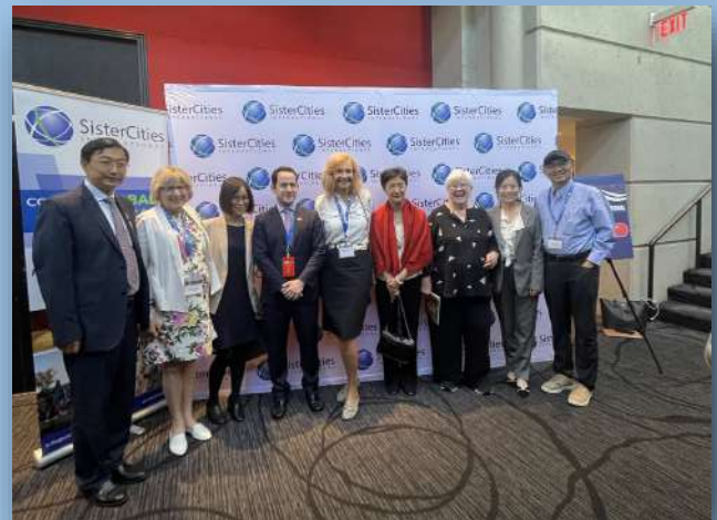
Participants from New Mexico and Chi- na Delegations