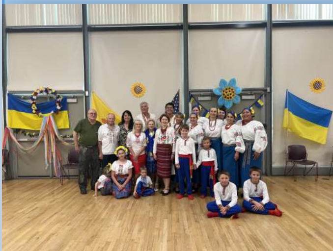
Ukrainian Americans of New Mexico