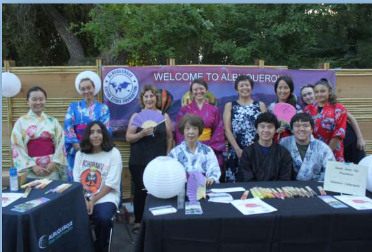
Sasebo committee volunteers

We just finished our Obon Festival partnering with Albuquerque Bio Park on Friday, August 16th in the Sasebo Japanese Garden. We had a very successful event of more than 500 audiences. The Sasebo Sister City Committee had tables with names written by Japanese Katakana on colorful Japanese paper fans and teaching origami to make cranes to promote peace by those students who volunteered from the Japanese Language Class from the Albuquerque Public School CEC (Career Enrichment Center). Japanese paper fans were given away from the sister cities committee. We created a QR code for our group for donations of our future youth delegation trips to Sasebo City, Japan which we are planning in Spring of 2026