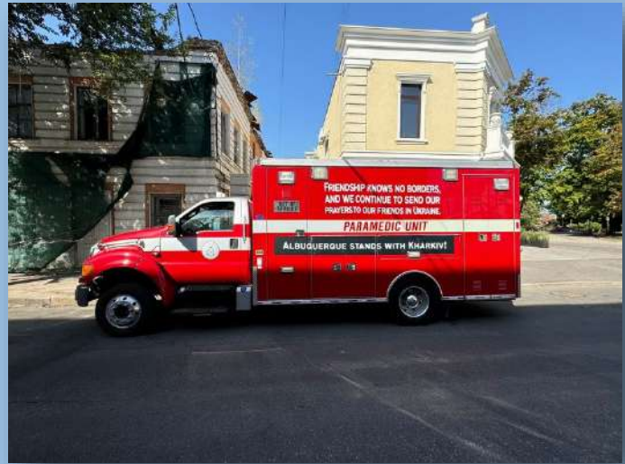
Ambulance that was gifted