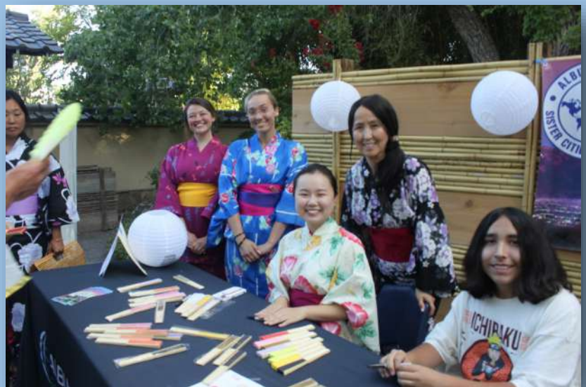
Sasebo committee volunteers