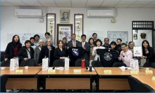
Presenting the Career Enrichment Center (CEC) T-shirts to the principal and staff of Hualien Senior High School.

Our delegation visited National Hualien Senior High School (HSHS) on the same day. A year ago a Memorandum of Understanding was signed between HSHS and Albuquerque Public Schools' Career Enrichment Center, to foster educational and cultural interchanges. The two schools started a virtual cultural exchange in 2021, out of the desire to stay in contact during