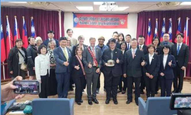
Group photo at the conclusion of the ceremony.