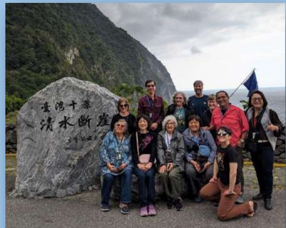
At Ching Shui Cliff, by the Pacific coast just north of Hualien.