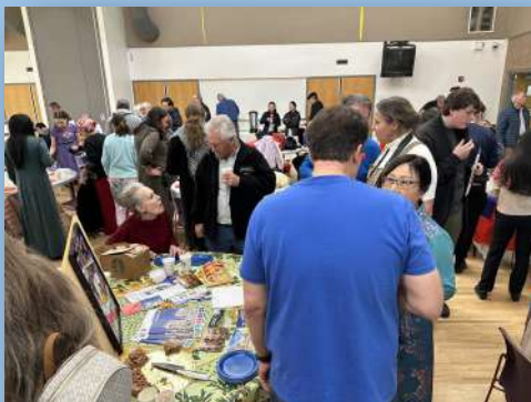
People Finding more information

captivating the audience with their music, dance, and storytelling. Thank you to those who came out to the event.