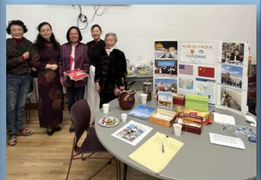
Contributors supporting Lanzhou, China