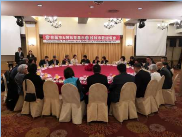
Lunch with Hualien City staff.