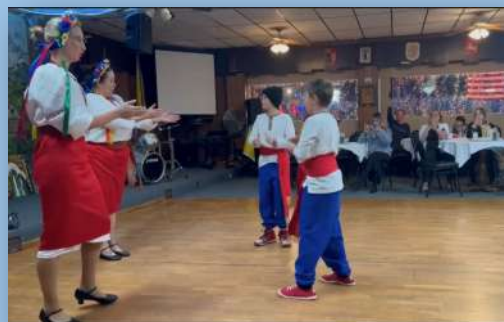
Performances at WinterFest

On December 10th, members of the Albuquerque Sister Cities Foundation and the Ukrainian Americans of New Mexico Organization celebrated WinterFest at the Edelweiss Am Rio Grande - German American Club. The group enjoyed traditional Ukrainian dances and violinist performances. Each Sister City shared what festivities their city enjoys during December and the New Year. It was wonderful seeing everyone who attended and we miss those who could not be there. Enjoy your time with your family and friends this Winter!