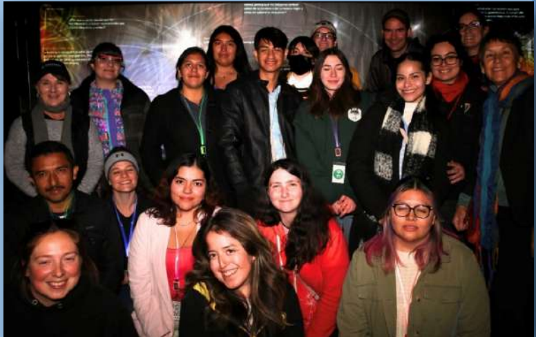
All Ambassadors, students, and Sister Cities representatives