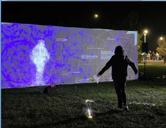
Space Messengers in action