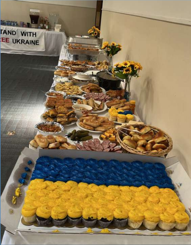
Traditional food from Ukraine

On Saturday, August 27th, the community gathered to celebrate Ukraine's Independence Day. Celebrating a country full of culture. Spectators were able to see live performances, music and try traditional foods. Despite the hardships of war, everyone was able to gather and celebrate traditions that have been passed down through generations.