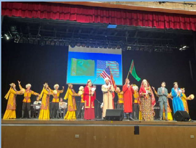
All of the dancers and musicians