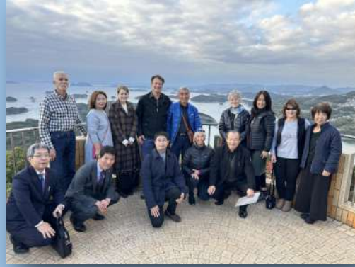
The Kuju Island Kanno park overlooking the 99 islands.