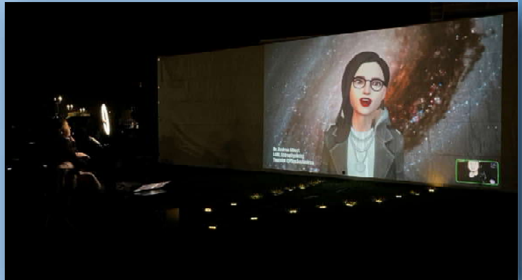
A Spectator asking an Astrophysics