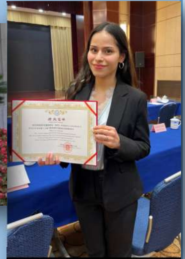
Celeste receiving a certificate