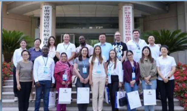
All of the professional candidates