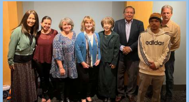
Supporters that helped make everything possible