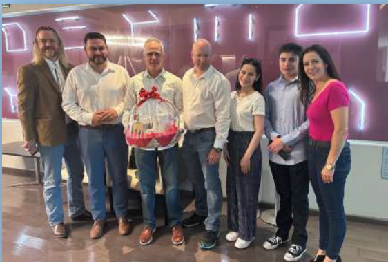
Exchanging gifts between cities