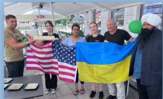
Arrival into Ukraine