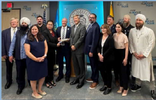
City of Albuquerque team