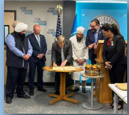
Protocol of Intent signing

Citizen diplomacy was born in the wake of World War II to empower peacemaking at the grassroots level. The war in Ukraine has reminded us of the importance of these efforts. We're inspired by Albuquerque's leadership in answering the call for humanitarian aid to the people of Ukraine.