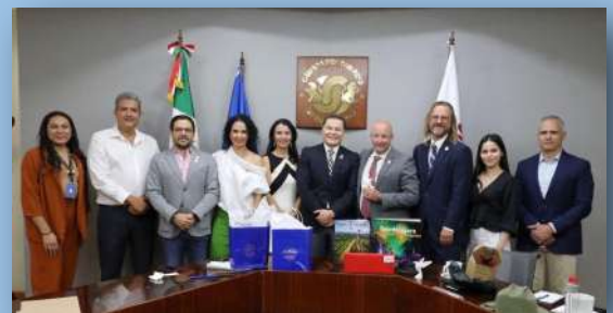
City of Albuquerque and the City of Guadalajara