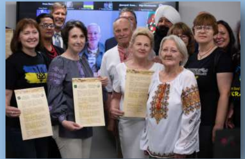
Protocol of Intent with Mayor Keller and Mayor Terekhov