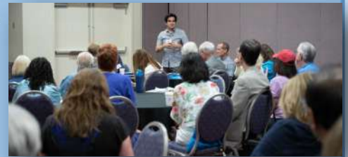
Breakout room discussions