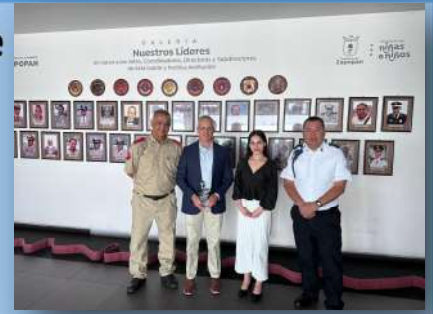
Albuquerque's Battalion Chief and Guadalajara's Fire Chief

In addition to the festivities surrounding the anniversary, our delegation, comprised of leaders from the City of Albuquerque Economic Development Department and the The Albuquerque Hispano Chamber of Commerce, met with additional City officials and the Guadalajara Chamber of Commerce Cámara de Comercio de Guadalajara to discuss trade and tourism initiatives.