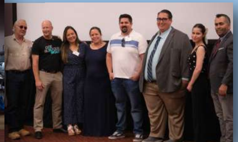
City of Albuquerque team