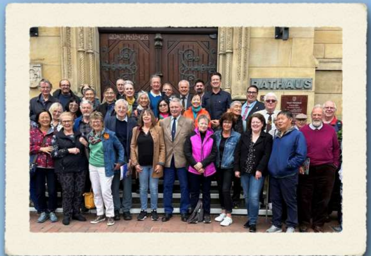
Meeting with Mayor Shobert