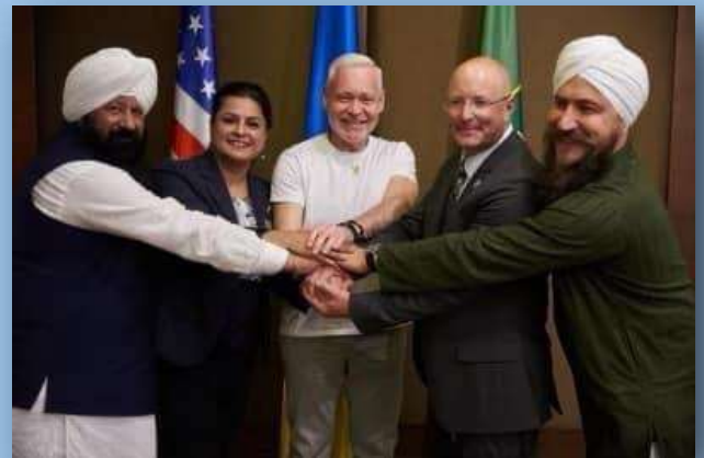
Uniting two Cities