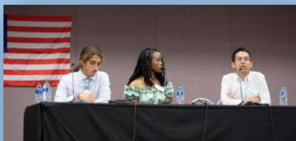
Youth Delegation panel