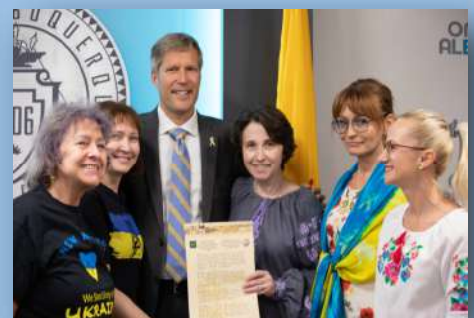
Mayor Tim Keller with Ukrainian American New Mexico Organization