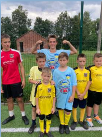
Soccer kids getting ready for their match