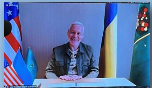
Mayor Ihor Terekhov, Kharkiv Ukraine