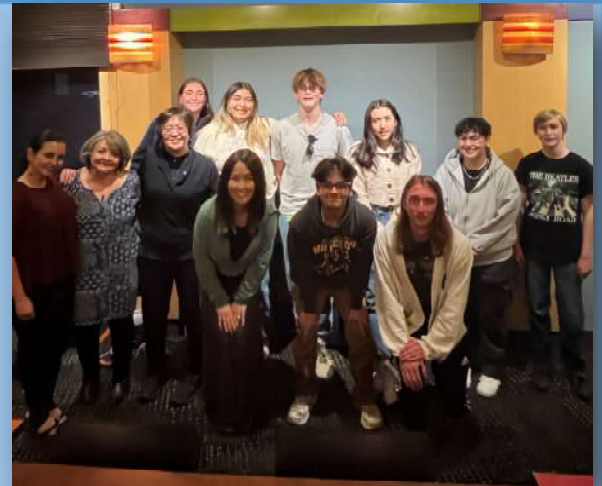
Students from the Japanese Class CEC