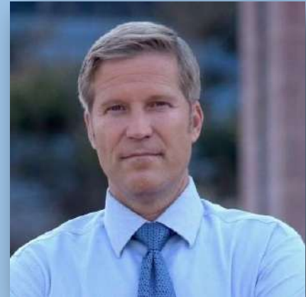
Mayor of Albuquerque, Tim Keller