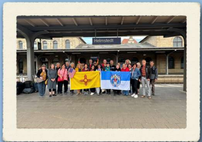
Group that attended the festivities