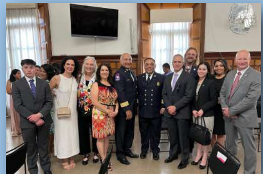
Celebration of Guadalajara's legacy of firefighters