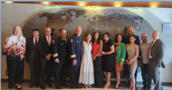
Full delegation that attended the anniversary