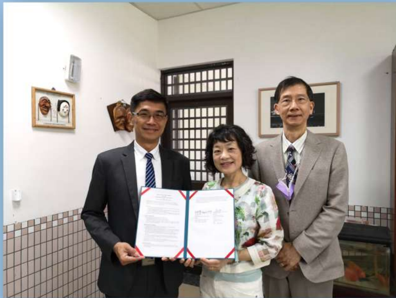
Presentation of MOU at the National Hualien Senior High School