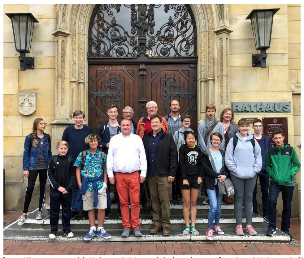
Delegation from Albuquerque with Helmstedt Mayor Schobert (center front) and Helmstedt Sister Cities members.