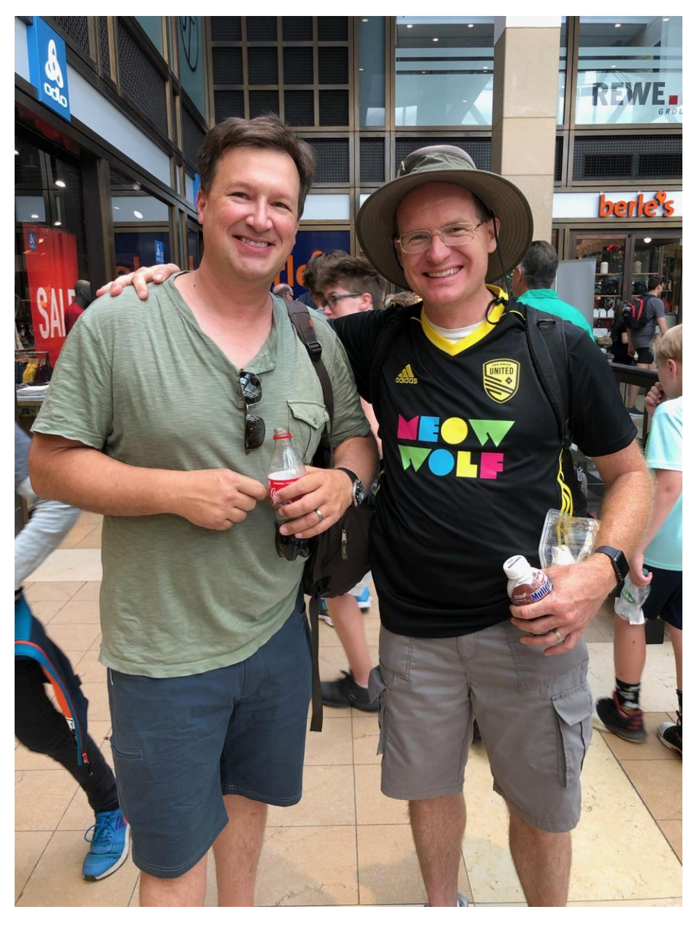
What \ are \ the \ chances \ of \ two \ Albuquer queans \ meeting \ on \ the \ same \ walking \ tour \ in \ Berlin?