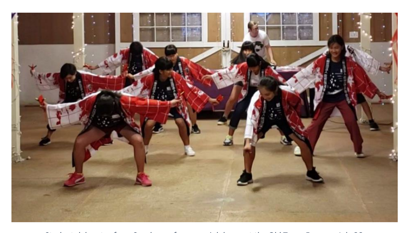
Student delegates from Sasebo perform special dance at the Old Town Farm on July 28.