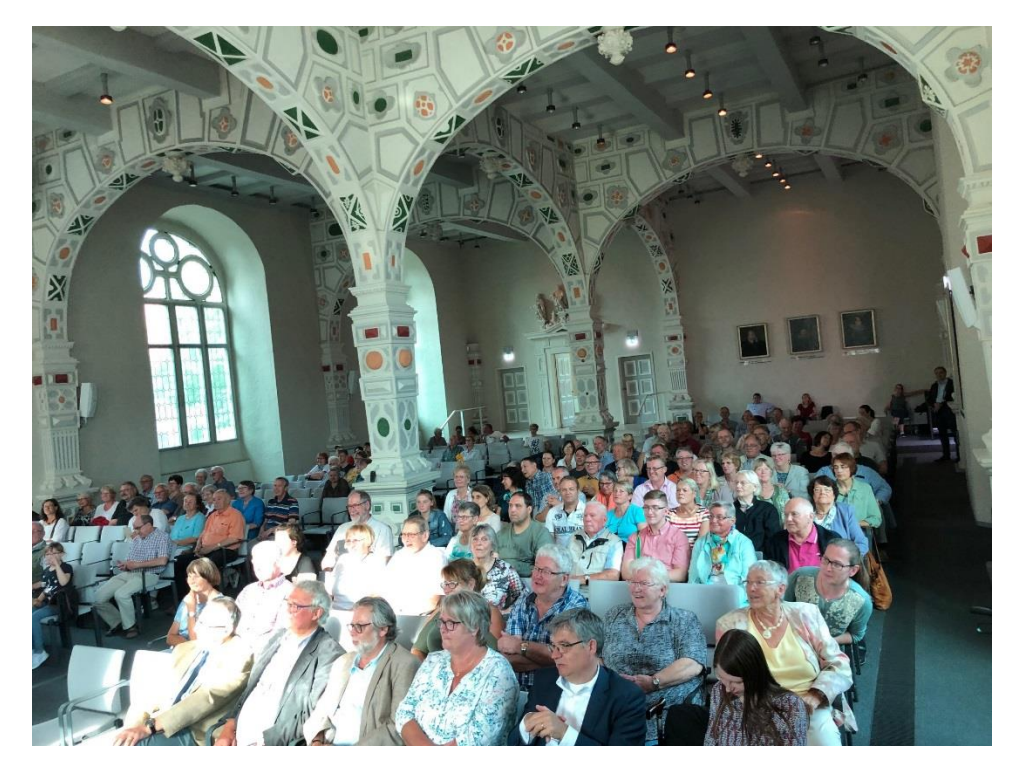
It's a full house at the July 18th performance held in Helmstedt's 16^{th} century Juleum building.