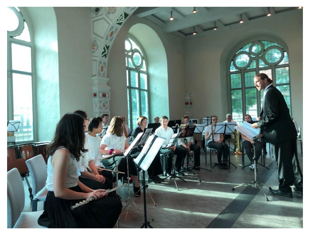
Albuquerque and Helmstedt students practicing for their performance on July 18^{th}