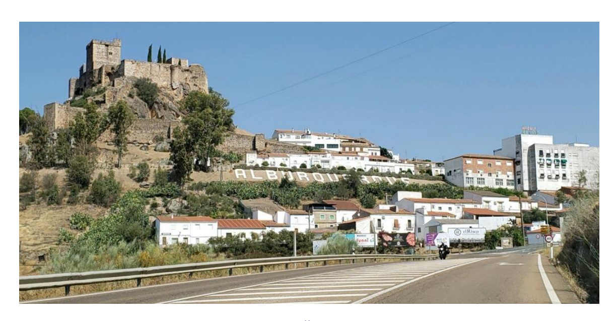
Our Sister City Alburquerque, Spain