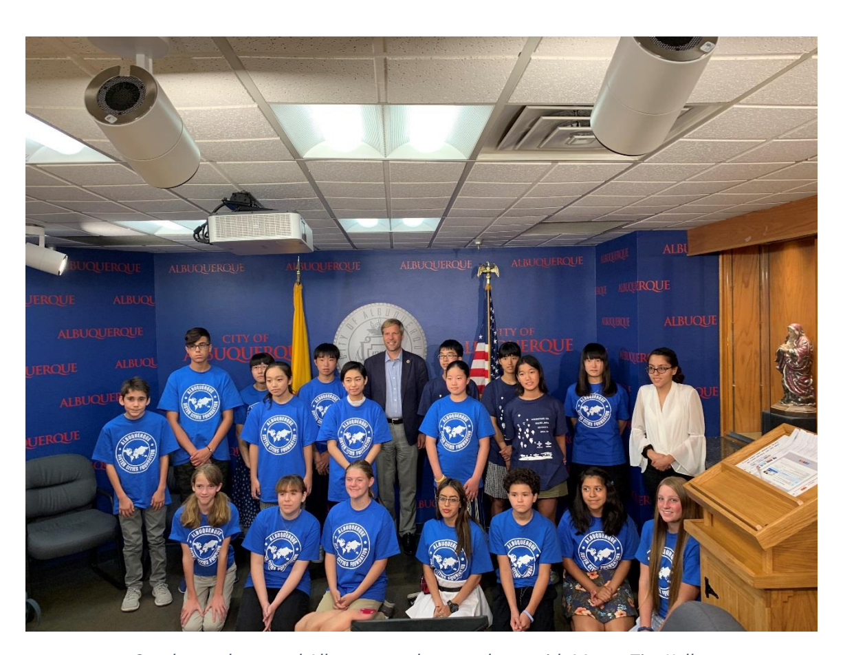
Sasebo students and Albuquerque host students with Mayor Tim Keller

The purpose of the Youth Exchange is to further the Sister Cities' mission of promoting world peace and friendship between nations through people to people diplomacy.