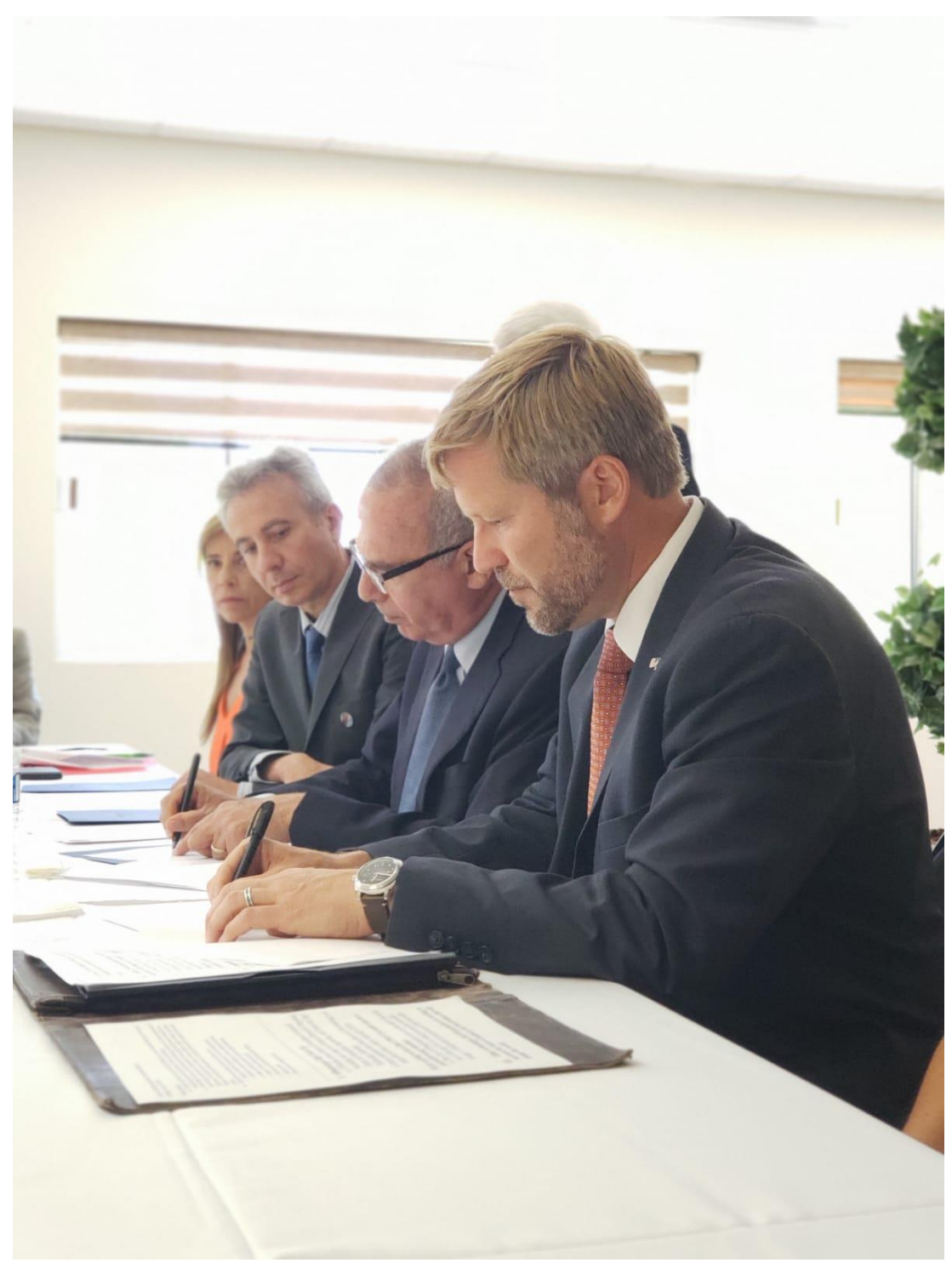
Albuquerque Mayor Tim Keller participates in the official kick-off of the Bilateral Commission with our Sister City of Chihuahua, Mexico.