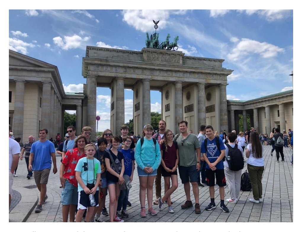
{\it Albuquerque\ delegation\ sightseeing\ in\ Berlin\ at\ the\ Brandenburg\ Gate}.