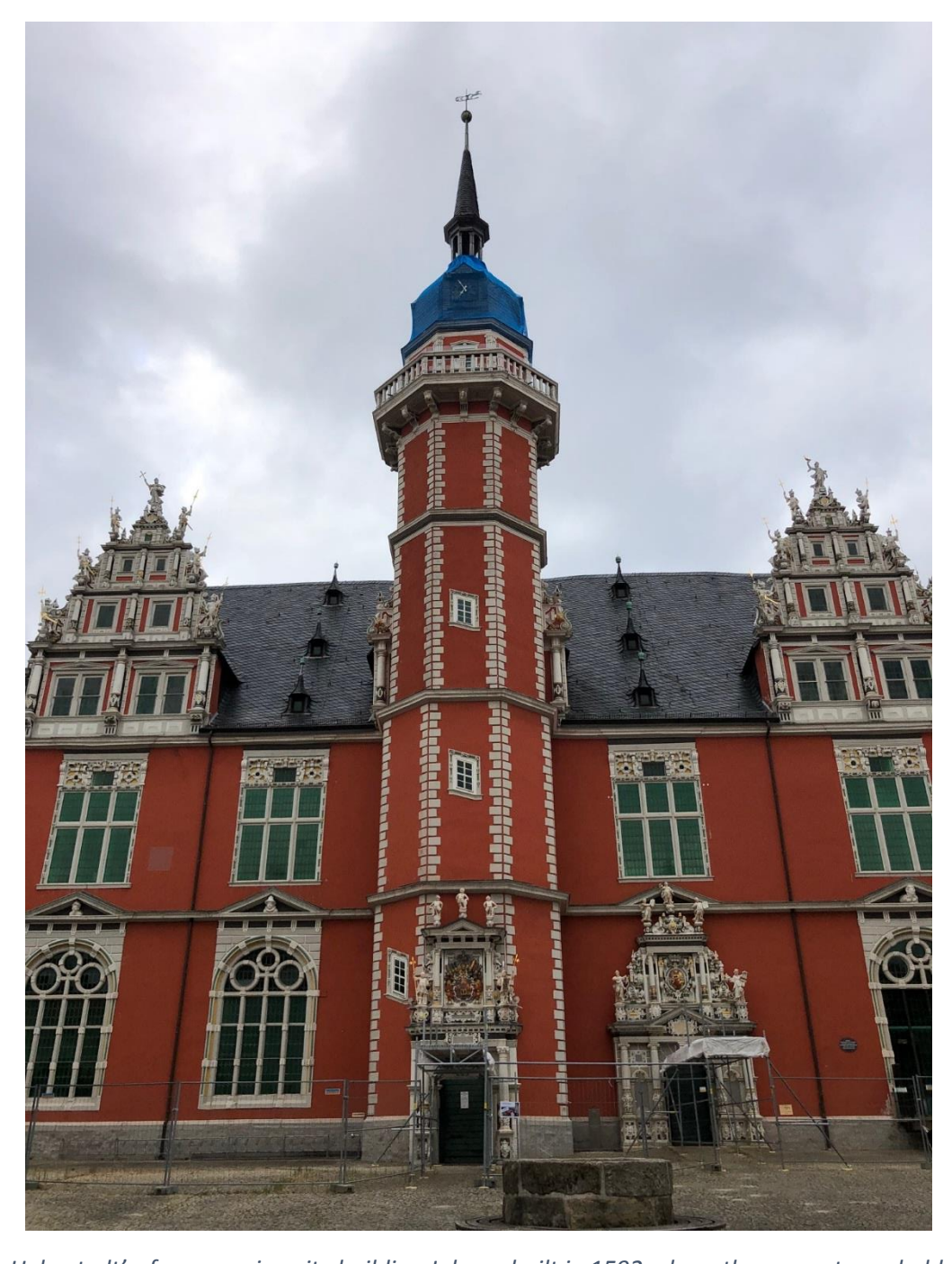
Helmstedt' s former university building Juleum built in 1592 where the concert was held.