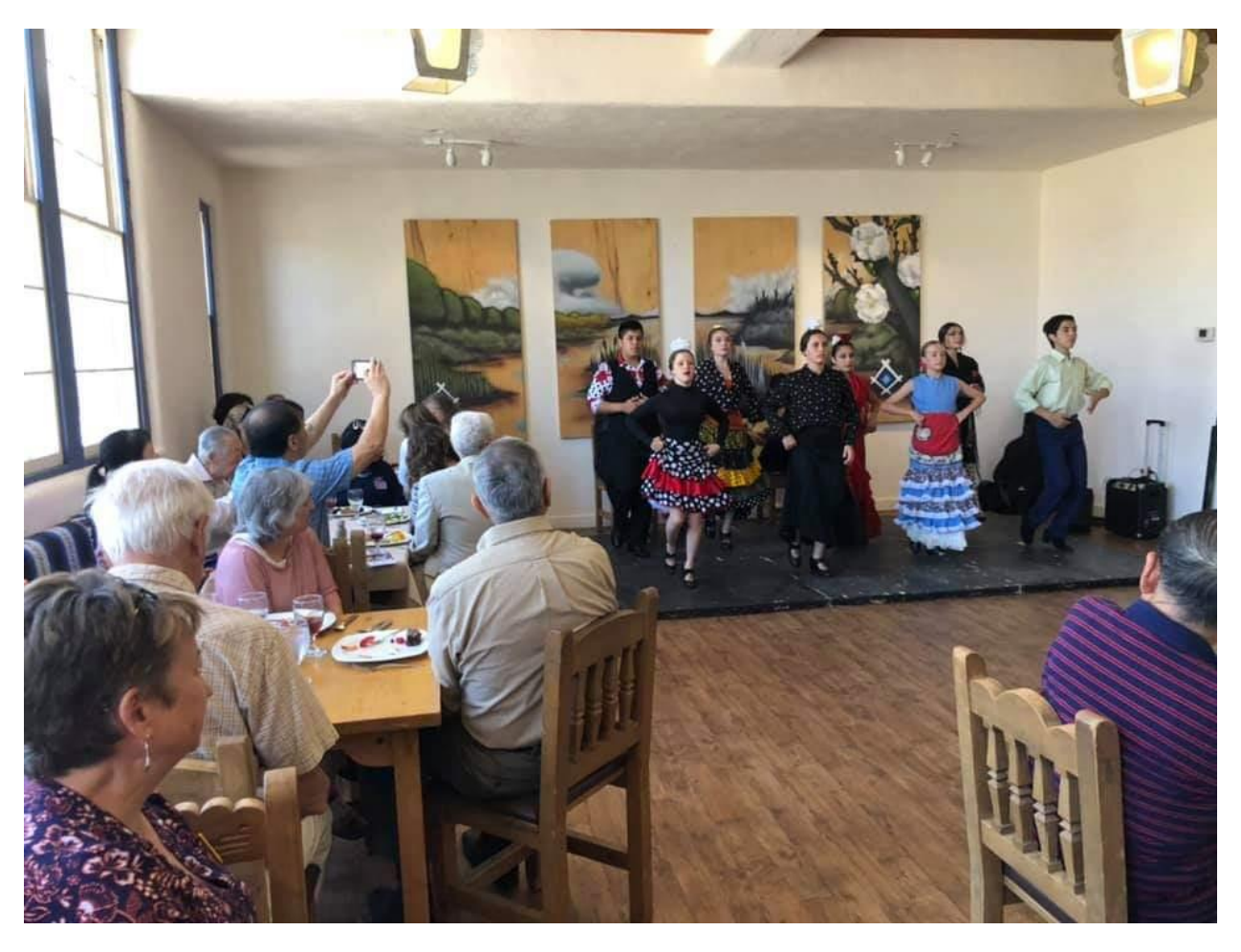
Flamenco dancers from National Institute of Flamenco provided entertainment at ASCF's June Annual Meeting