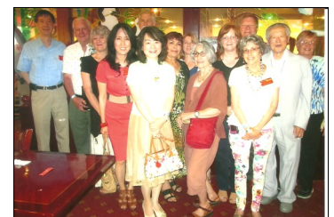
R: ASCF Board Chairs and Co-Chairs.