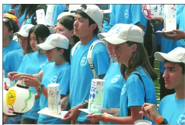
Japanese students with their host family "brothers or sisters" display their lanterns.