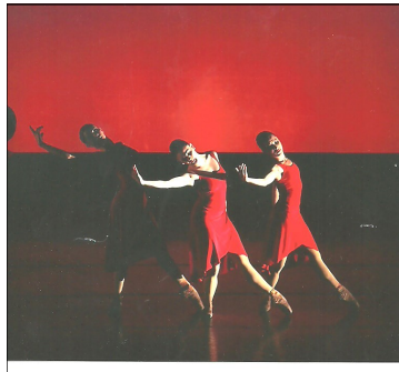
Left: Joven Ballet dancers performing "La Muerte del Angel."

Ballet Folklorico de Guadalajara will be coming to Albuquerque in mid-November. The tentative dates for their visit are November 12-17. Details about their main presentation on Nov. 14 will be forthcoming! Check the calendar on our website for updates. www.albuquerque-sister-cities.org