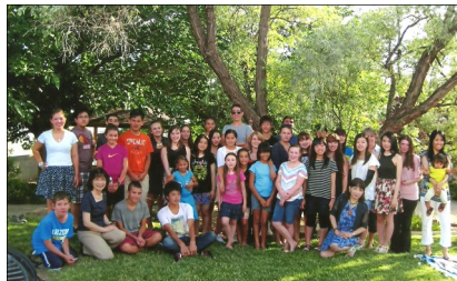
Japanese Delegation and home stay hosts.