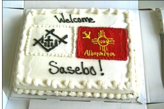
Cake welcoming Japanese Delegation