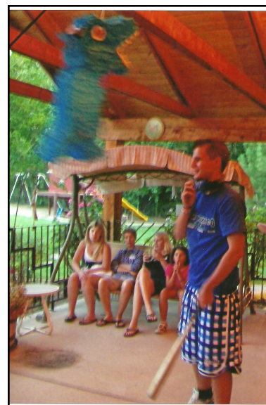
Helmstedt youth celebrates his birthday with a pinata.