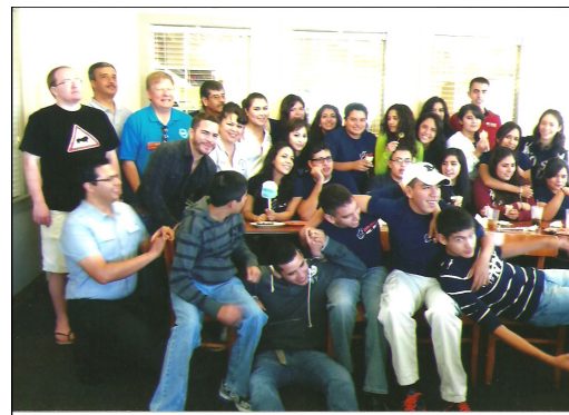
Chihuahua High School Marching Band relaxing at lunch hosted by ASCF

September 14 - 16, Chihuahua's High School Color Guard and Marching Band visited Albuquerque to help celebrate Mexico Independence Day. The group performed at the Washington Middle School and at the University of New Mexico where they were hosted for lunch and dinner. The 45 students and 5 chaperones traveled here by bus. ASCF treated them to lunch on Saturday. ASCF also hosted five Tarahumara members: two marathon runners and three artisans. The two runners competed in a half marathon, where they had the honor to meet the legendary gold medal Olympian Billy Mills. The three artisans displayed and sold their authentic handicrafts made with native materials such as wool, bark of pine trees, leather, mud and palm leaves.