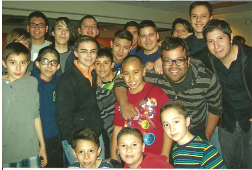
One of several groups from Juarez, Mexico, in the State of Chihuahua.