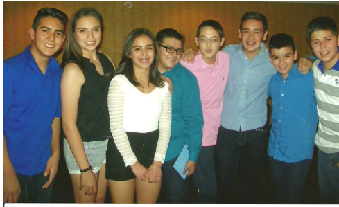
The fun of RoboRAVE is not just the competition but meeting new friends and interacting with friends from previous competitions. It was great connecting again with this group from Juarez, Mexico.