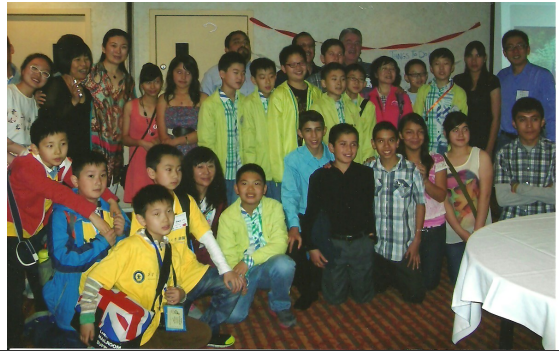
Chinese students and friends—There were 30 participants from Taiyuan, Shanxi Province, China.