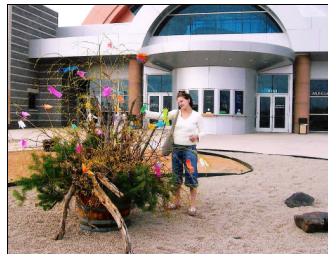
Peace tree in front of the Balloon Museum.