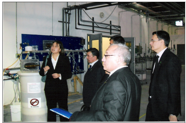
Turkmen and interpreter touring MIOX