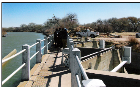
Angostura diversion dam in Algodones