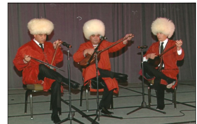
Turkmen Musicians playing ancient instruments from Turkmenistan.