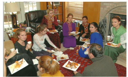
Turkmen enjoying the special lunch.