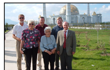
Standing near a new mosque