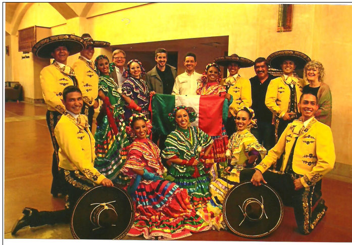
After the Gala Performance at the National Hispanic Cultural Center