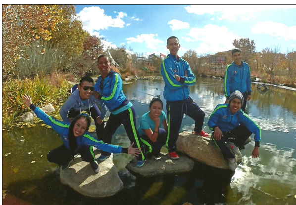
Ballet Folclorico dancers at the BioPark.