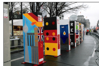
Dominoes placed where the Berlin Wall once was located. They were toppled during the ceremony commemorating the fall of the Berlin Wall.