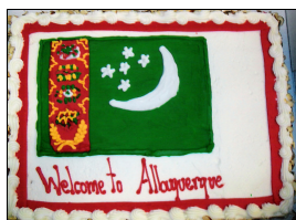
Cake at Welcoming Reception.