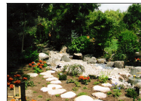
View of the Ogata Kai "garden within a garden."