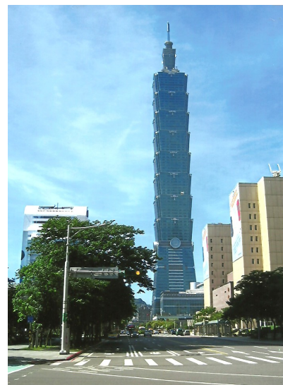
Taipei 101—World's tallest skyscraper in 2004