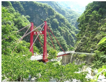
Taroko Gorge, Hualien