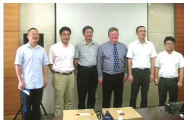
Lin'an officials pose for pictures