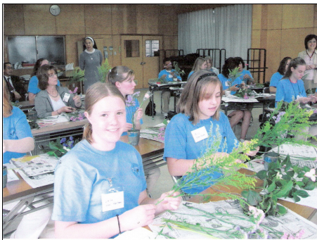
Seiwa Girls Junior/Senior High School - Everyone learned how to make IKEBANA arrangements