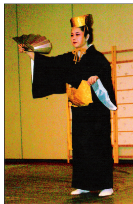
Dance celebrating longevity