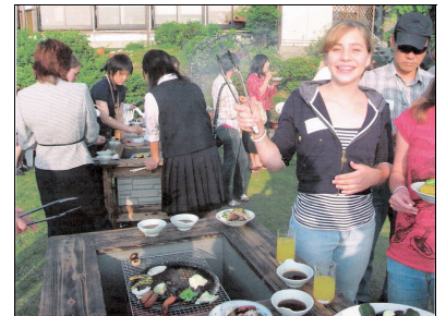
BBQ at Hanaichi Restaurant - The youth delegation learned how to BBQ Japanese style.