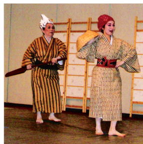
Dance describes life in a fishing village - men who catch fish & girls who bring them to the mar-